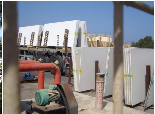
Natural Quartz surfaces available in the USA for the classic modern enthusiast.

Located next door to the Caesaria National Park in Israel is the CaesarStone production facility. Their catalogue lists, “Kibbutz Sdot Yam, Israel, adjacent to the Roman city of Caesaria”. We were two busloads of pilgrims from Christ the Redeemer Catholic Church in 2009 on the first morning of our trip. I was quite shocked when we passed the CaesarStone sign to find myself walking distance from the global